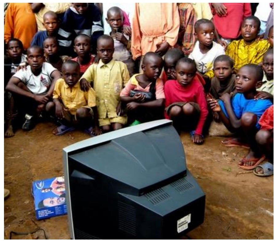
What will be your next items?